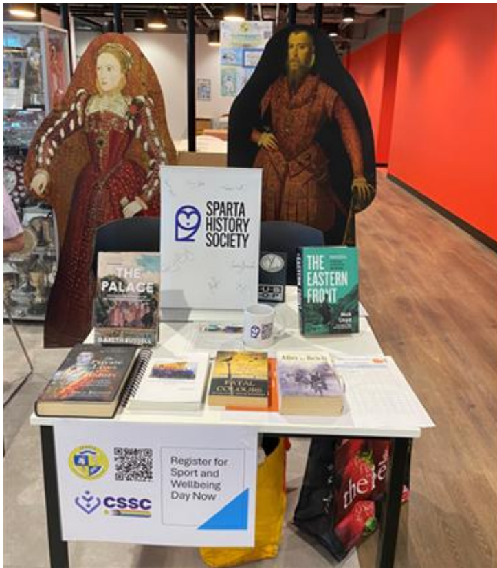
The History Society display at the SPARTA Meet the Clubs event