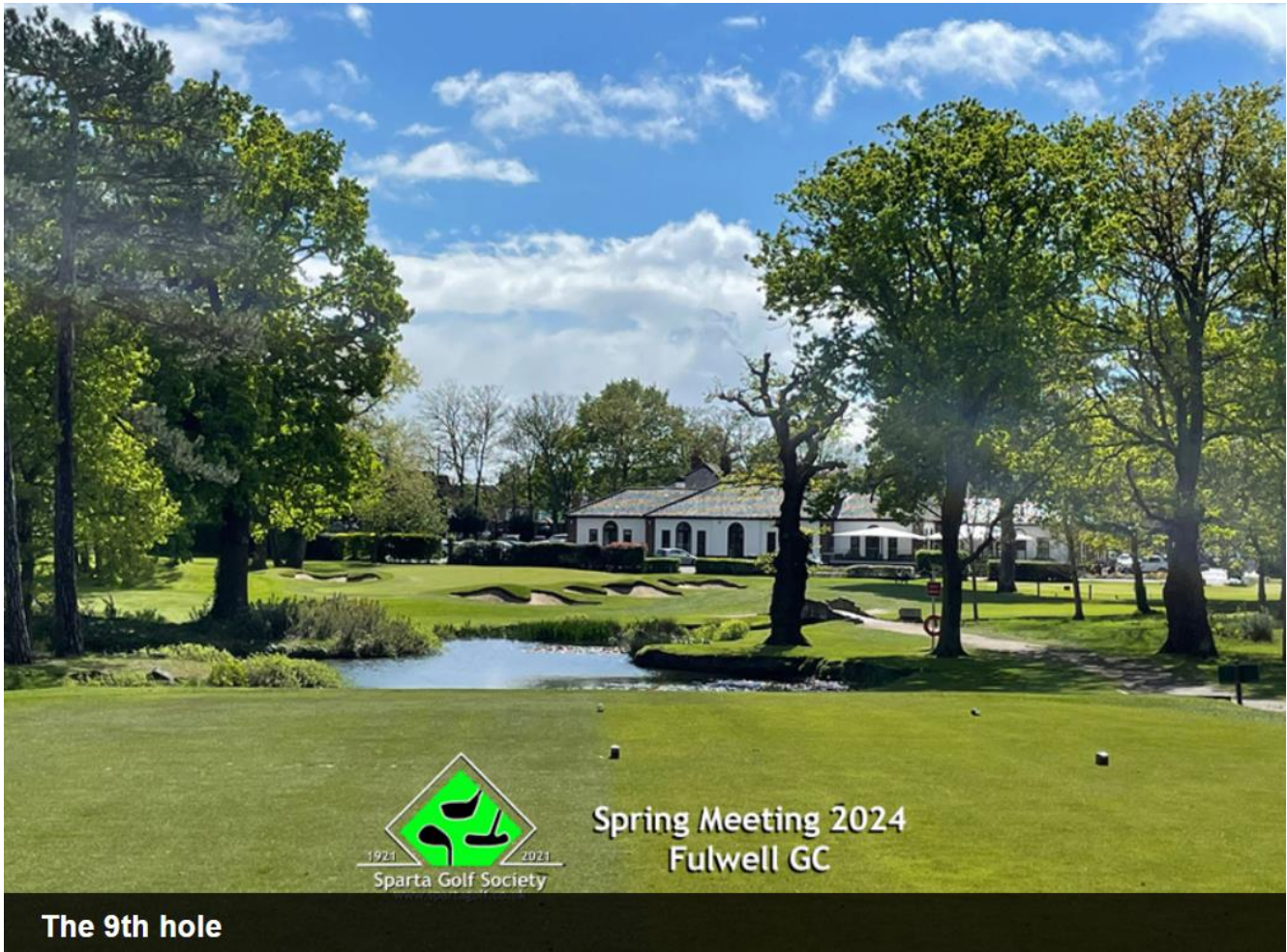
The 9th hole

Attendance at meetings this year continues to be low despite our efforts to attract new recruits and a change to the format at some meetings. Our efforts to increase numbers will continue next year with visits to more interesting venues although with prices still on the rise, some of our choices will be out of our price range.