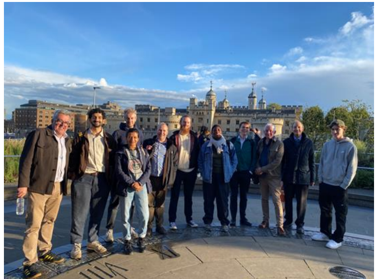
Above Right: London Slave Trade Walk outside The Tower of London